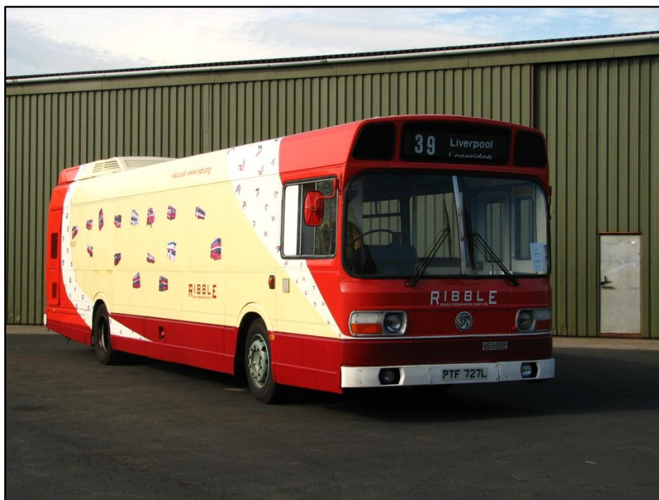
Former Ribble PTF 727L, now owned by the Ribble Vehicle Preservation Trust is seen at their Freckleton site. This will be one of many Leyland Nationals on display at the British Commercial Vehicle Museum on Sunday 18 th March 2012.

With this in mind, the Ribble Vehicle Preservation Trust has kindly agreed to allow group members a visit to their Freckleton premises on Saturday 17 th March 2012 . The site is not normally open to the public and contains some rare and interesting vehicles. This is a unique opportunity to see behind the scenes of one of the jewels of bus preservation.